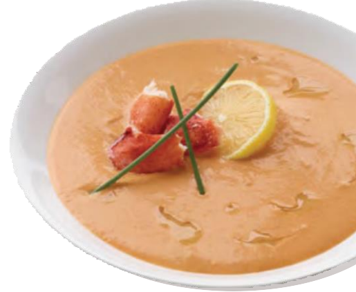
Campbell's® Reserve Lobster Bisque with Sherry (21068)

This versatile classic is made with fresh cream, tender pieces of lobster, real butter and a hint of sherry. Serve it with a truffle oil drizzle for extra decadence or use it as the starting point for creamy Lobster Mac & Cheese .