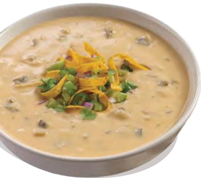
Campbell's® Reserve Roasted Poblano & White Cheddar Soup with Tomatillos

We can help you make the most of your investment by using soup as an ingredient for all kinds of menu items. And we know it's not just about saving money—it's also about delighting guests with great taste.