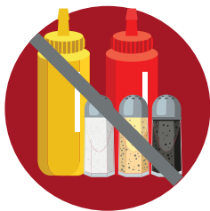
No Condiments Needed